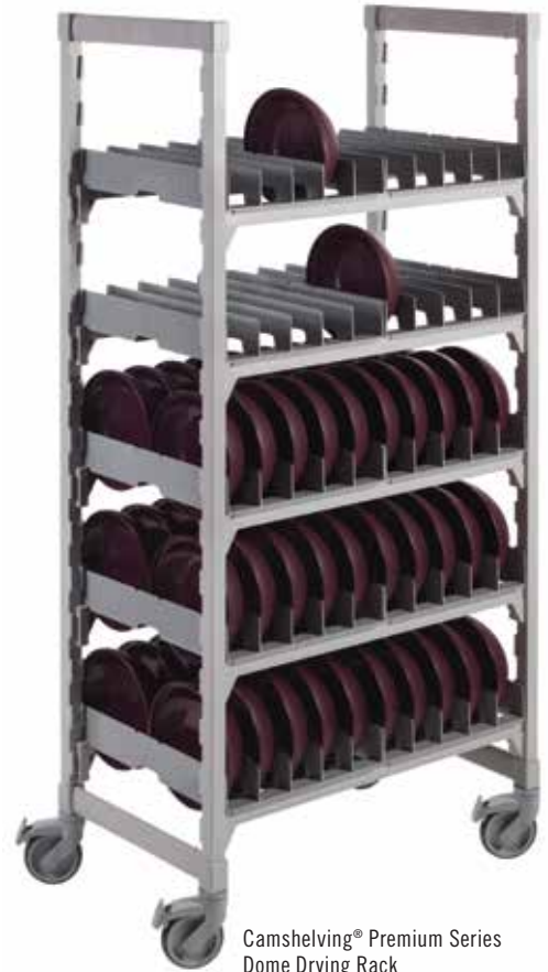
Camshelving® Premium Series Dome Drying Rack